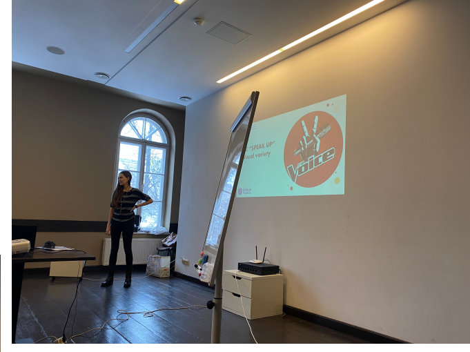
give a speech how to use your voice, how to conquer the fear of public